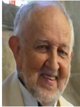
Hon Assistant Priest