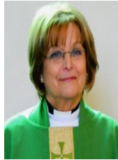
Hon Assistant Priest