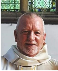
Rector of Saint James'