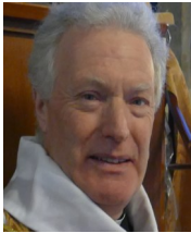
Hon Assistant Priest